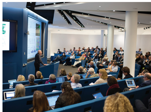
SFARI’s 13th science meeting in April, 2018 brought together over 150 SFARI investigators, collaborators, with foundation staff.